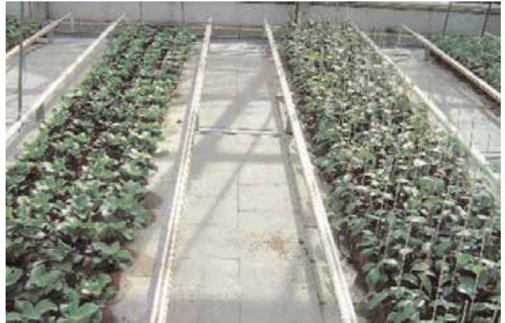
Shadows with clear covering