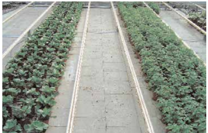
No shadows with HD Soft White